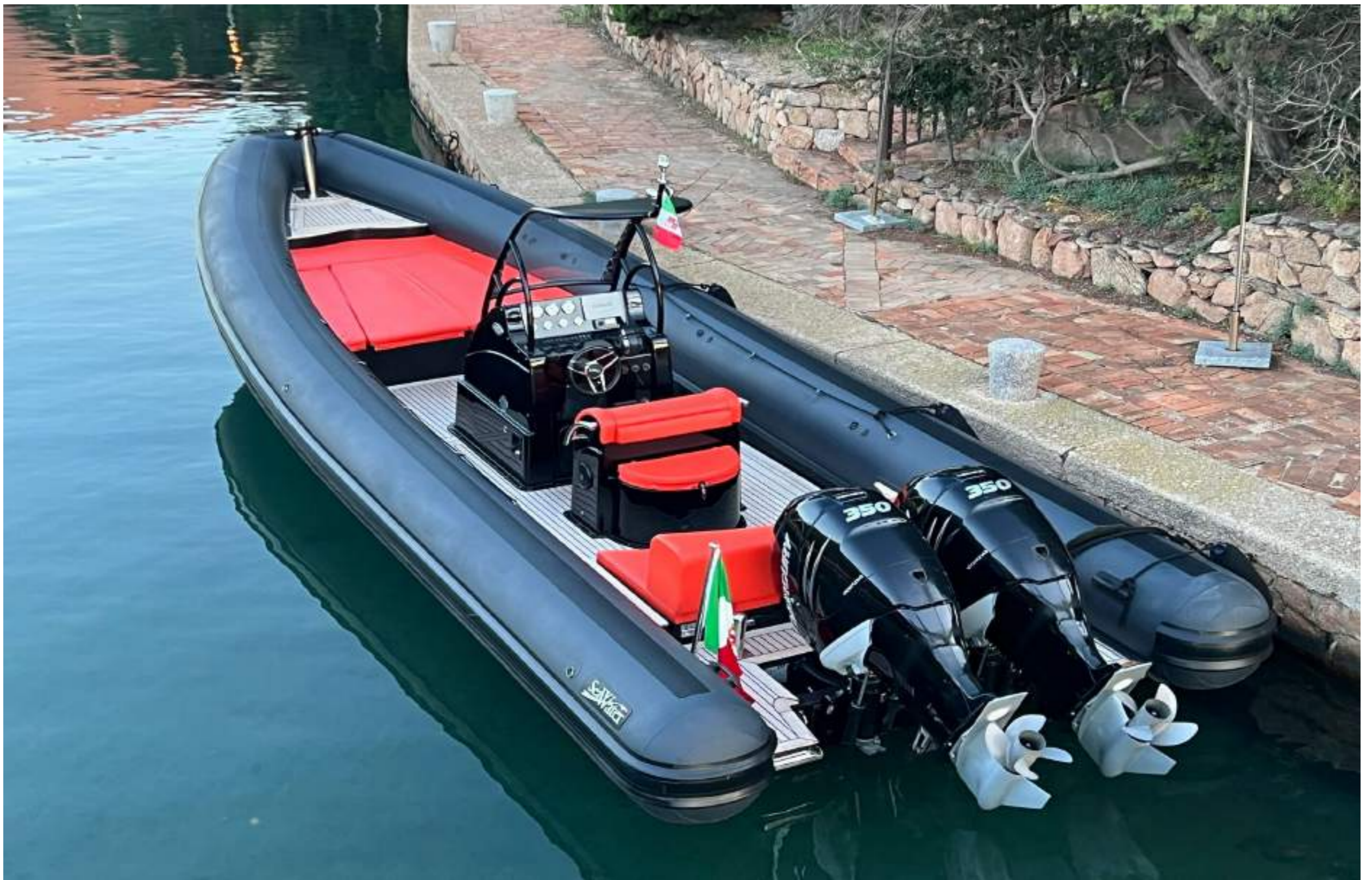
SEA WATER SMERALDA 300