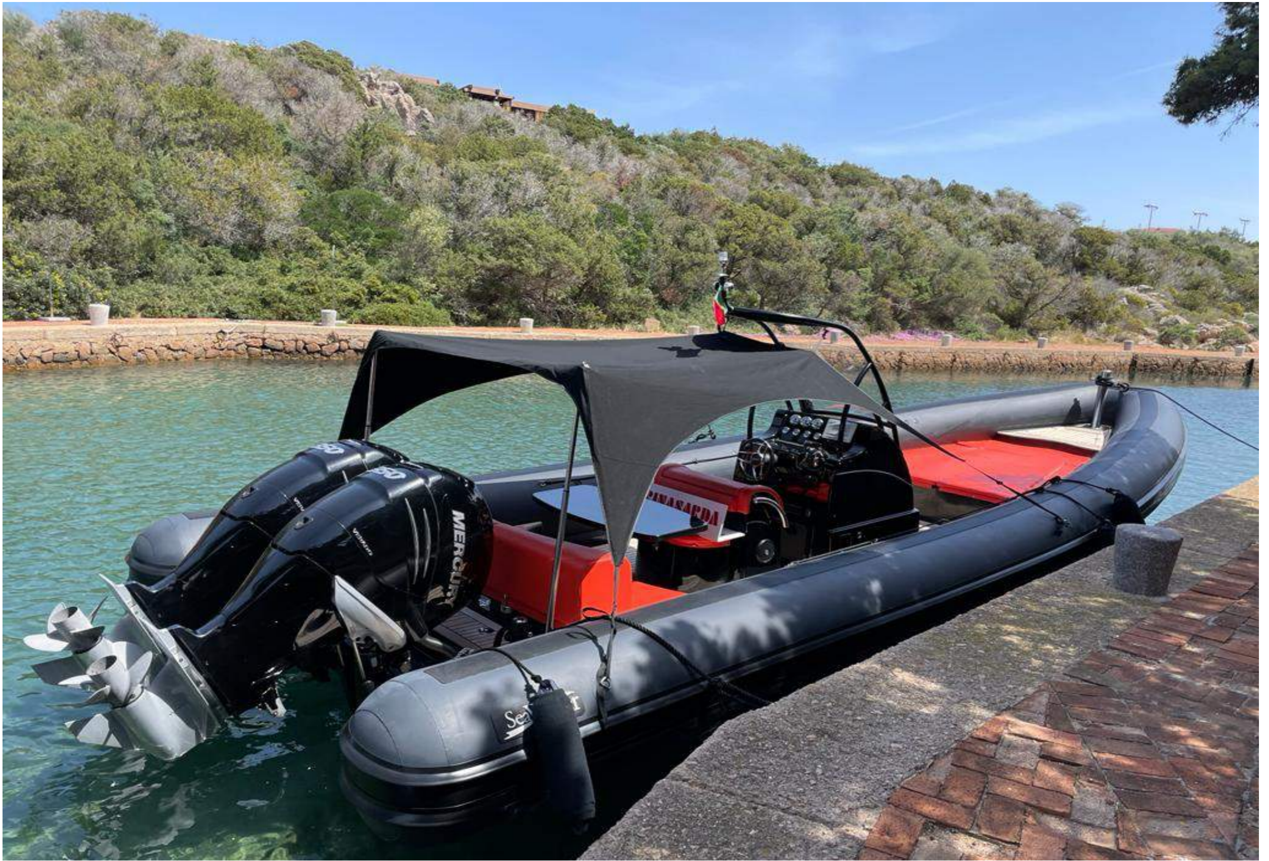
SEA WATER SMERALDA 300